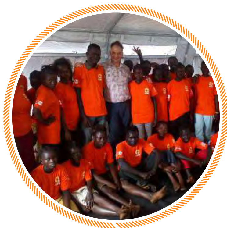
Photo: Alain Sibenaler, the UNFPA Uganda Country Representative and SRH/GBV project Congolese Refugee Volunteers at Kyangwali Refugee settlement

Women’s Health Matters: The volunteers shared that there are a lot of gynecological issues that are not adequately addressed in the settlement. The CARE team suggested that sourcing a gynecologist would be of tremendous benefit to the women and girls living in the Kyangwali settlement.